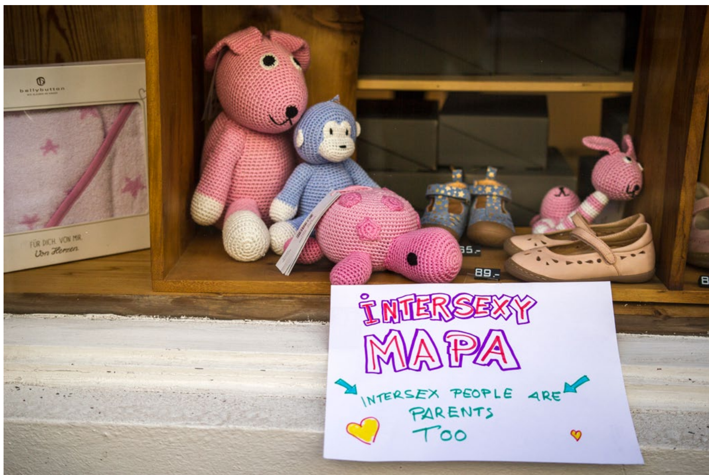
Image from the activist workshop at the First OII Europe Intersex Community Event