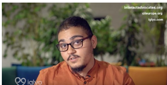
“We are here” is an Intersex youth awareness raising video that was launched on Intersex Awareness day 2016 with subtitles in 11 European languages.

Intersex youth present at the meeting held the first