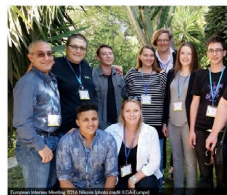
Welcome to the increasingly visible world of intersex