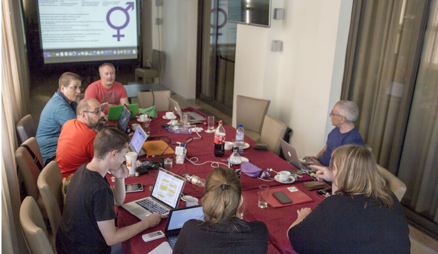
Coffee-Break during the Steering Board Meeting in Nikosia, Cyprus, 2016